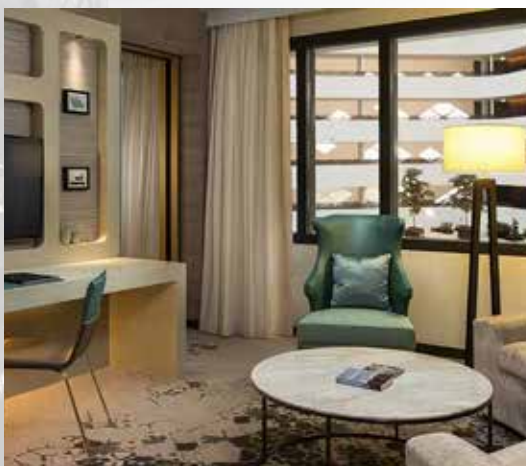
Rooms in the Hilton Schiphol hotel equipped with Forest KS rails.