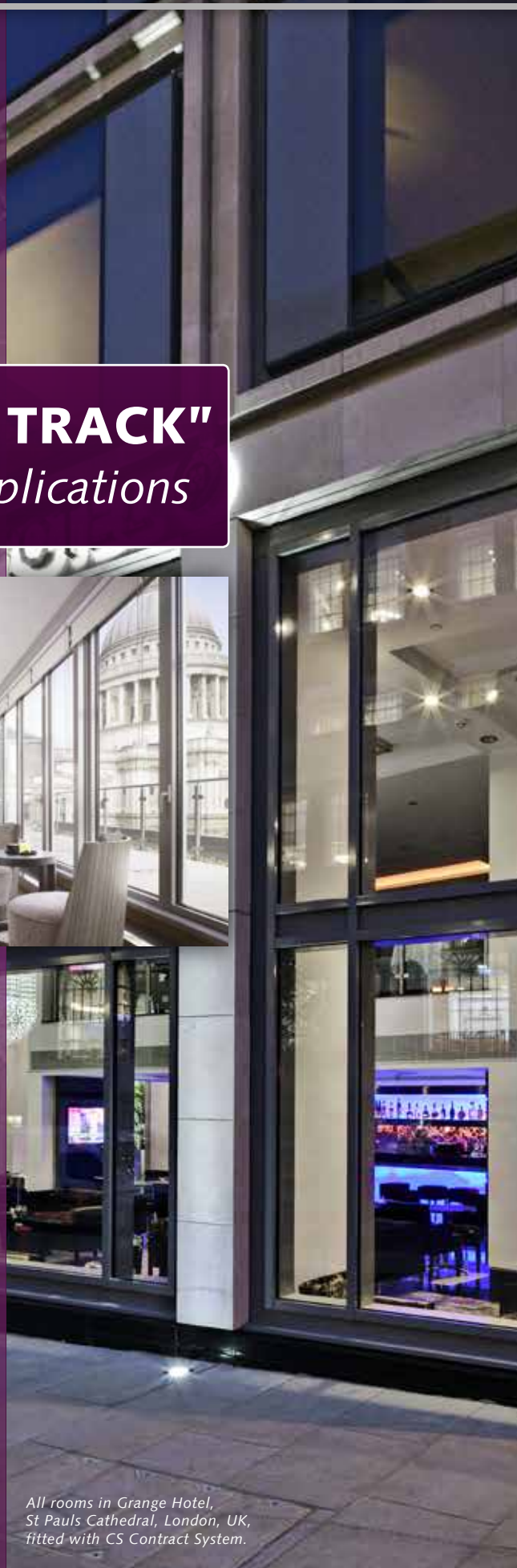
All rooms in Grange Hotel, St Pauls Cathedral, London, UK, fitted with CS Contract System.